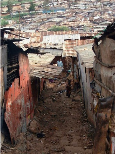
1 Kibera houses and alleys

In most societies, it is taken for granted that members of a population have the basic human right of shelter. This right is not and should not be a matter of great legal or political debate, as it is a fundamental necessity for the survival of individuals, families, and cities. The commonly used term for shelter, “house” or “home”, has become synonymous with the idea of dwelling, belonging, and safety, and for many of us, this is exactly what it provides. The house becomes not only a place to eat and sleep, but asserts itself as a vehicle for life, fully engrained in our psychology and well-being. Essential to the home is a sense of ownership and permanence, and the security of knowing that our property cannot suddenly be taken from us. This is not the case in Kibera, Nairobi.