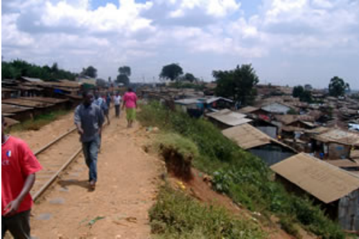
4 Railway through Kibera