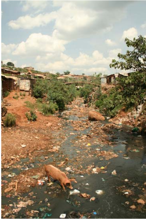
2 Sewage and waste are discarded in local rivers.