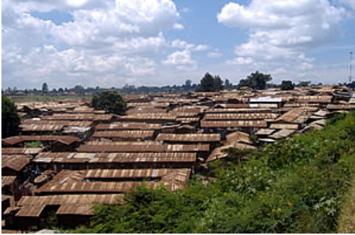
3 Rooftops: Orderly at first site.

the problem are the rights to the ownership of the land and buildings that compose Kibera. The Nairobi government in no way recognizes the slums as a legitimate settlement of people. Its only interest in the site and its population is a result of the immense profits that are to be made through property rent. A segment of the government called the Provincial Administration has the authority to grant licenses to wealthy landowners who wish to build on the site. However, the structures must remain temporary, as it is government land that they are being built on. The owners of the buildings, often government officials themselves, then rent the temporary structures to the residents for uncontrollable and unreasonable prices. "Kibera is not a mud hut city because of its people. It remains mired in the muck because the system denies the residents control over their future. Corruption and profiteering keep it this way." 5 Essentially, the people who are actually living in the slums do not own the land they live on or the houses they live in, and have no right to build better, more permanent houses for fear of reprisal from slumlords and government officials.