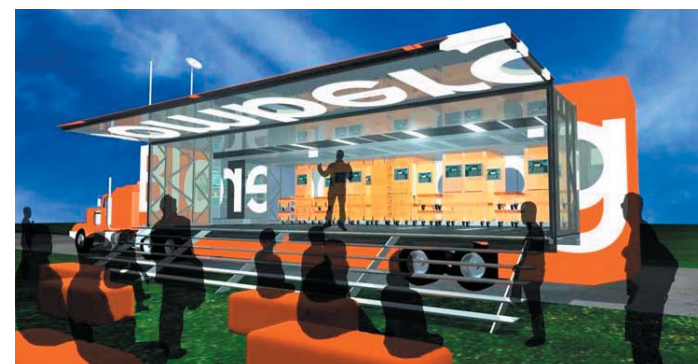
Figure 5 - Bloomberg Mobile Unit, closed and open (iv)