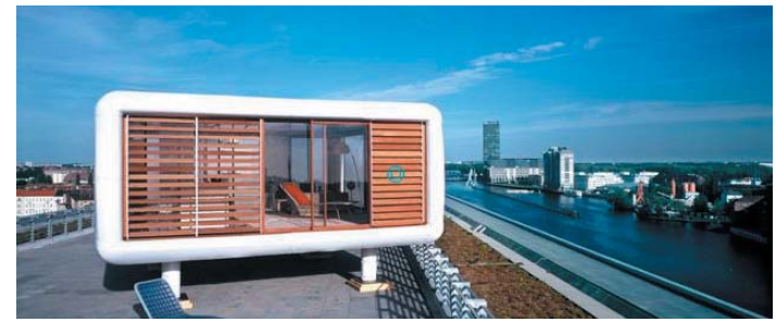
Figure 6 - Loftcube on urban roof (v)

Our design was similarly constrained by the dimensions of a standard rental moving vehicle. Companies such as Budget and Ryder have fixed sizes for the vehicles they offer, and “Wall” had to be capable of fitting in them in order to be a realistic option for the potential user. The intention is that in a society where people, especially young professionals, may have to move a number of times early in their careers, any investments they make in their homes should be capable of moving with them. By being able to move the object from place to place, the object becomes a piece of furniture.