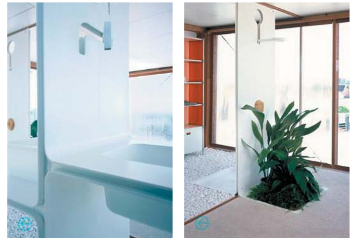
Figure 7 - kitchen and bathroom details of Loftcube (v)