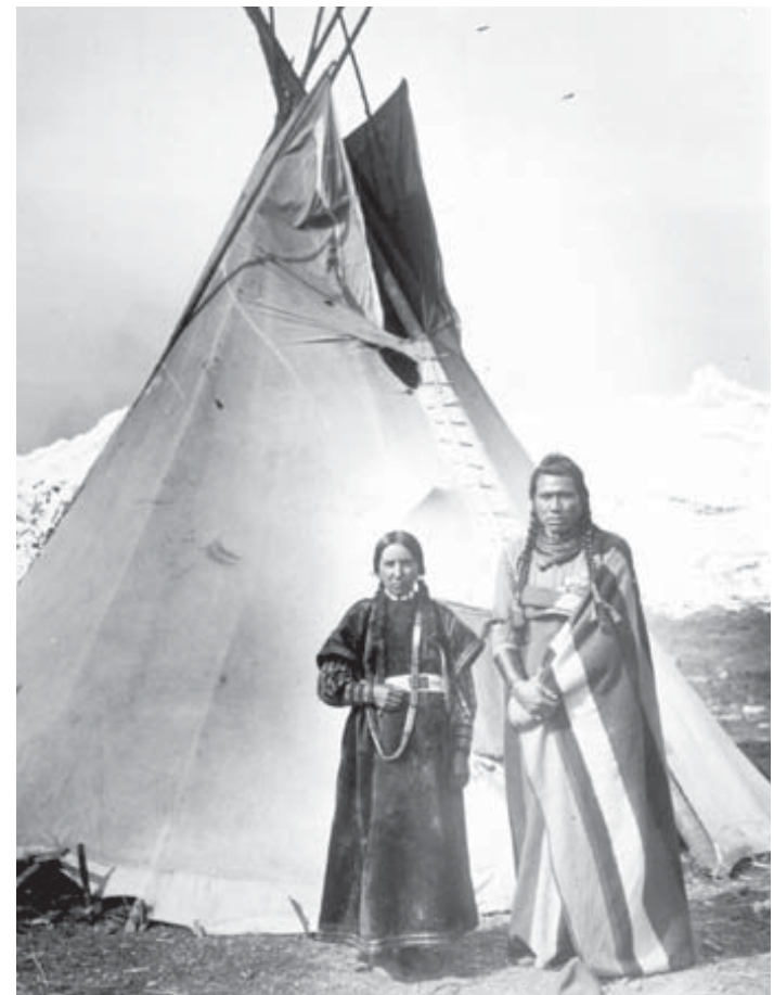
Figure 1 - Tipi of the Nez Perce tribe (i)

This is not, of course, a new idea. The indigenous populations of North America built structures that were meant to be moved whenever the food supply or climate was no longer capable of sustaining them (Fig.1). More recently, however, examples of movable architecture have incorporated ideas about how a single object – car, chair, mechanical pencil – can house more than one function, such as the historic Volkswagen Westfalia of the 1960s and 70s, which was at once living quarters and mode of transportation (Fig.2). The objects of our daily lives must be both portable and multifunctional in order to be considered practical.