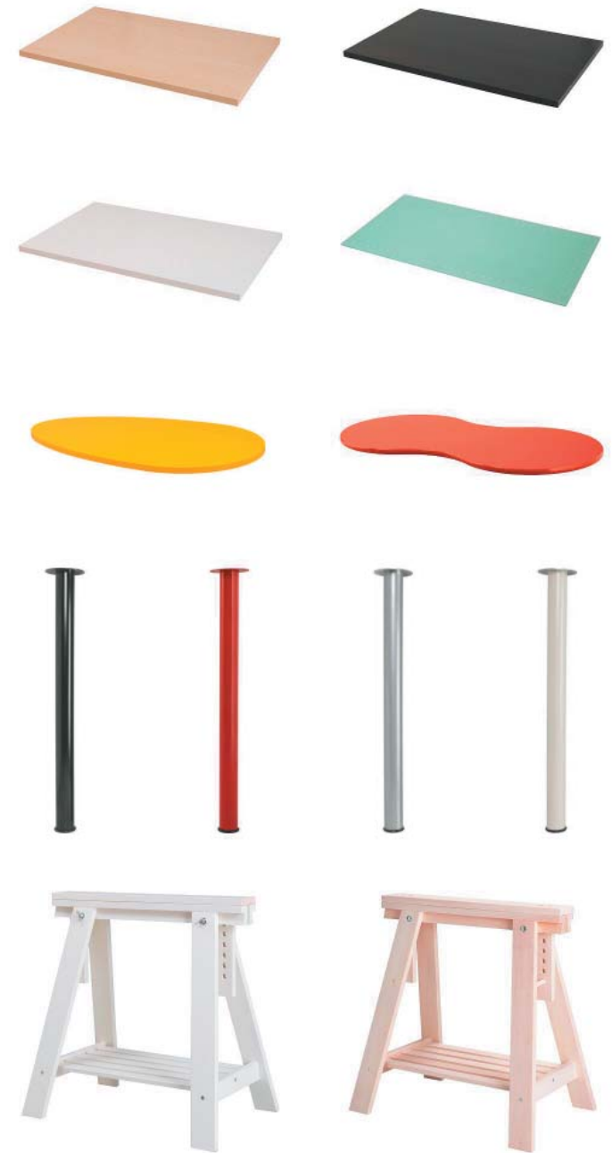
Figure 3 - A selection of table top and leg options from the Vika table system, Ikea Sweden, 2006 (iii)

This method of housing the functional aspects of a piece of furniture behind panels and doors can be seen in such early examples as sewing machines built into desks and stereo systems integral in credenzas. Encouraged by