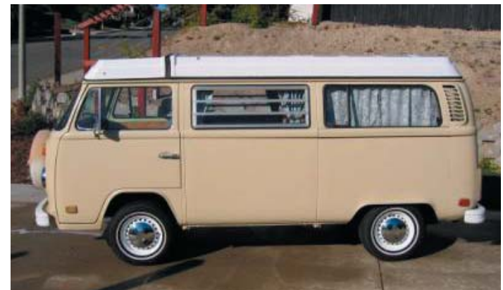
Figure 2 - 1974 Volkswagen Westfalia (ii)