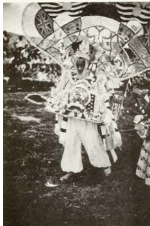
Fancy Clown

The evolution of this particular type of Mas has come from the French beginnings when characters would parade on carriages and incorporates ideas of an ornate float as seen in Brazil's carnival. It has also grown out of building an idea through costumes of spectacular proportions that are carried by an individuals who either wear them if they are light enough or pulls them on wheels for larger and heavier representations. As you can see in the images below, older Mas costumes were smaller and although ornate were built onto the character. On the lower left you can see an old example of a float that is pushed by other masqueraders.