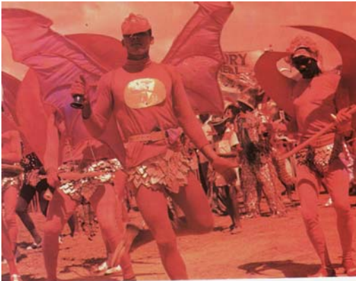
Imps from the Devil Band

called the Dimanche Gras that gives a prize for the most dramatic and creative costume. Each costume is made by hand. The materials used to make them today are primarily wire and fabric with various types of adornments. Some of them even include pyrotechnics.