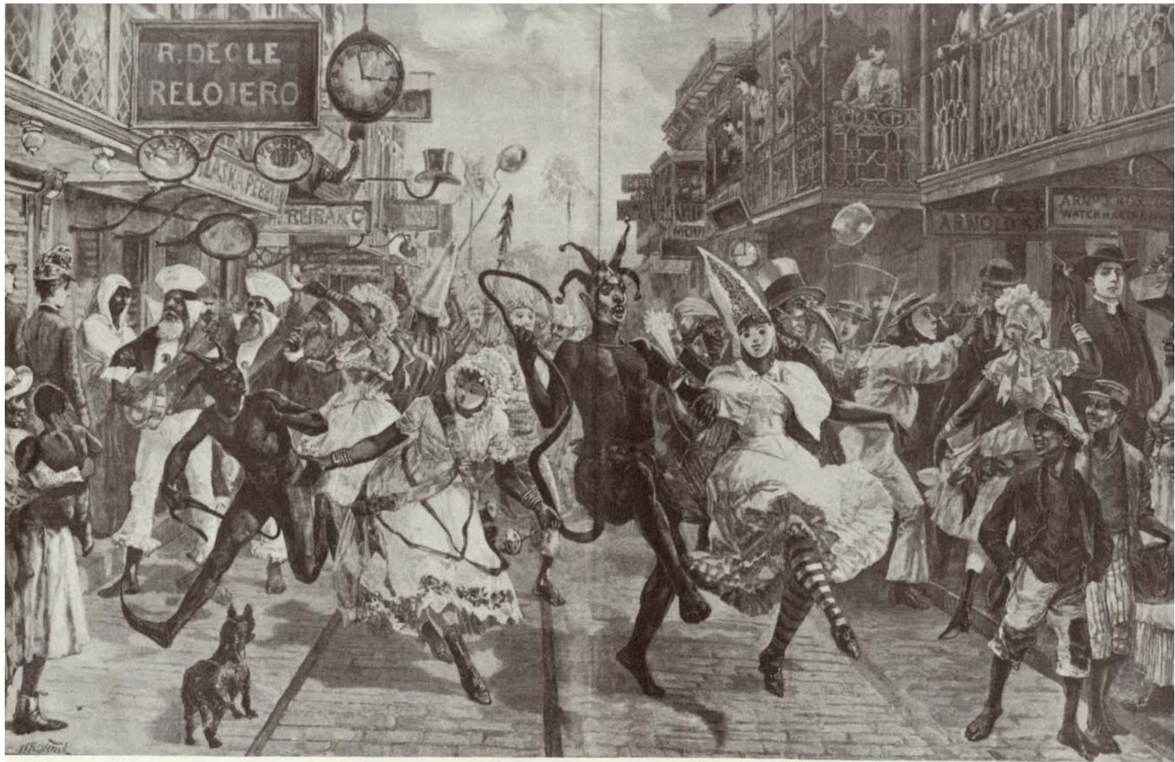
Carnival on Frederick Street, Port-of-Spain, 1888 (FROM A DRAWING BY MELTON PRIOR )