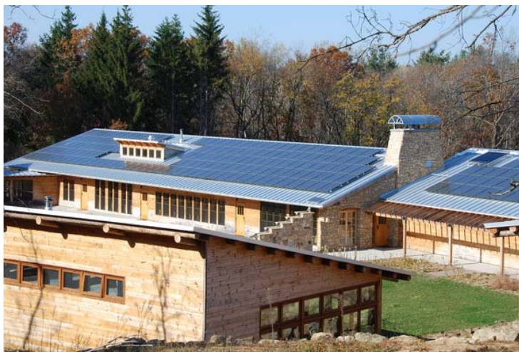
Fig. 3. The Aldo Leopold Legacy Center, Bariboo, Wisconsin. This LEED™ Platinum building is also the first carbon neutral building in the United States. The conception of the design began with a budget and resultant area that would be dedicated to the installation of roof mounted photovoltaics. The building’s energy use and size was designed with this limitation. Designed by Kubala Washatko Architects

Generally speaking, most of the energy requirements anticipated for carbon neutral buildings should assume electricity for their operation if the intention is to meet most of the energy needs through on site, non CO 2 producing renewables. Once the building and equipment have been designed for maximum effectiveness and efficiency, it may be possible to generate 100% of the required electrical energy on site – although site characteristics, location, orientation and sheer size may make this more difficult. Dense urban sites are likely to pose the most difficulty in this regard.