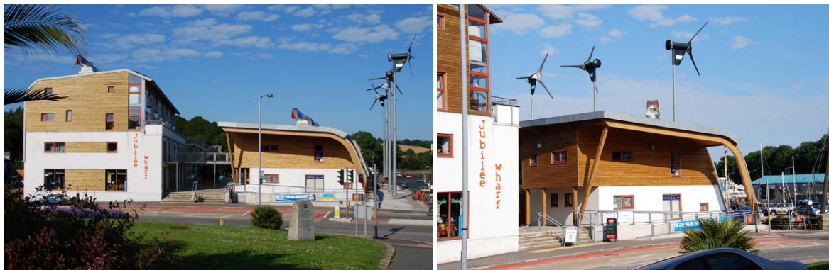
Fig 2. Jubilee Wharf, Penryn, UK. 2006. This zero energy development uses 4 micro turbines to provide power. Evacuated tubes provide solar hot water. The roof has been designed for PV, but no PV is presently installed. Directional wind cowls assist with natural ventilation to the point that no A/C is provided. A 75kW wood pellet boiler provides under floor radiant heating. The building is super insulated with 300mm of insulation netting a U value of 0.1\text{W}/\text{m}^2/\text{°k} . Designed by ZEDFactory.

reducing distances and reinforcing the sense of community. Consciousness about Global Warming is not the only driving force behind the UK impetus. There have been significant political issues surrounding a state of “Fuel Poverty” in the UK for many years. 8 Much of the housing stock is very old and poorly insulated. The cost of fossil fuel in the UK and Europe has long been many times higher than the rates charged in North America. Fuel poverty is defined as the point at which a home owner (typically at a lower income level) must choose between heating their home and eating. A household is said to be in fuel poverty if it needs to spend more than 10% of its income on fuel to maintain a satisfactory heating regime (usually 21 degrees Celsius for the main living area, and 18 degrees Celsius for other occupied rooms). In contrast to North America, where fossil fuel prices have been forcibly kept low, high fuel prices in the UK have made consumers and residential neighborhoods more accepting of wind and solar opportunities that can provide a lower cost alternative.