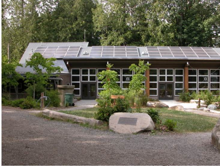
Fig. 4. IslandWood, Bainbridge Island, Washington. The buildings for this LEED™ Gold Eco Retreat were all sited to maximize their solar potential. Construction was kept to 3% of the site to minimize disturbance and preserve the natural eco systems on site. The roof of this education building is covered in PV to power the electrical needs of the classrooms. The building design uses passive principles and materials to retain heat and promote cooling. The roof is constructed in a butterfly shape to collect rainwater, which is directed for storage in a large cistern at the front left of the building. Although not specifically designed with carbon neutral as the focus, the project employs all of the base concepts that reduce demand and impact making zero carbon the next logical step. Designed by Mithun Architects.