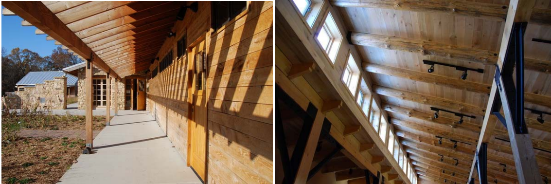
Fig. 5. The Aldo Leopold Center started with the sustainable harvest of the Leopold forest. The wood was assessed and sized to maximize the number of structural columns and beams. The remaining wood whose diameter was insufficient was cut into smaller members as well as exterior and interior cladding. The structural system of the building was designed based on the materials list. This runs contrary to normal practices where the building is first designed and the materials ordered (even if limited to a close radius to reduce emissions impacts).

Wood from certified renewable sources, wood harvested from your property, or wood salvaged from demolition and saved from the landfill can often be considered net carbon sinks. Certified wood is addressed in existing green building protocols as is construction waste management. Harvesting wood in a sustainable fashion from the site property or by arrangement from a local forest is new to the carbon problem. This has been successfully accomplished on the Aldo Leopold Center, the only carbon neutral project in the United States as of 2008. 17