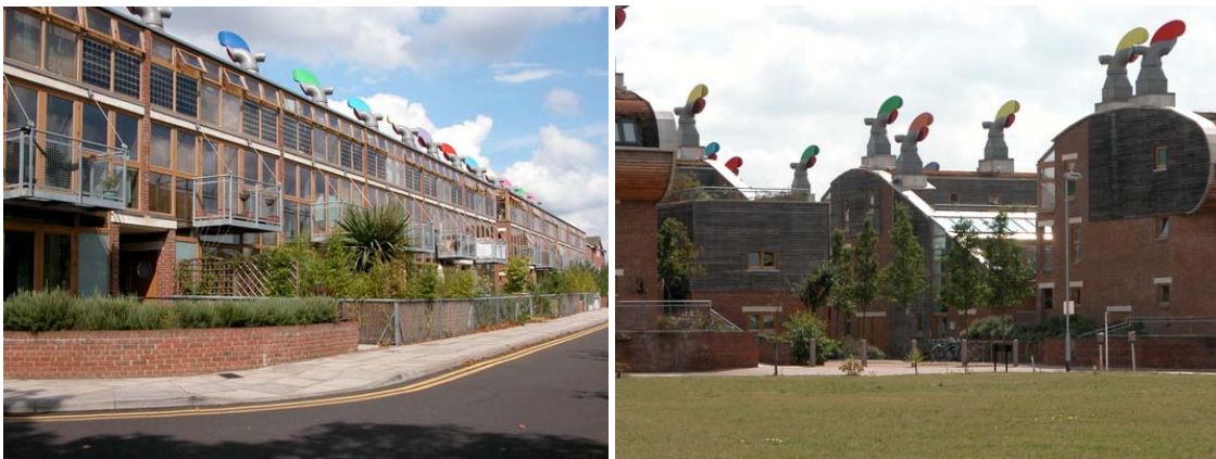
Fig 1. Beddington Zero Energy Development. 2002 This project takes a holistic approach to energy reductions. It uses a combined heat and power plant to provide energy to the complex. Energy requirements are reduced through passive solar heating strategies. The project uses super insulation to assist with heat retention. Air conditioning is not provided. Wind cowls assist with natural ventilation for cooling. Designed by ZEDfactory.

The issue of Global Warming, although arising from the arena of sustainable concern about the state of the built environment, is more specifically concerned with greenhouse gas emissions. It is the level of CO 2 that is the direct byproduct of the building industry that requires modification to existing Green Building Protocols to add its consideration. The United Kingdom's White Paper on Carbon Emissions, "Climate Change: The UK Program 2006" has set out very aggressive targets to meet and exceed their Kyoto promises. 7 Interestingly in the UK model, it is the residential building sector that is receiving the maximum attention, not commercial buildings. This is in absolute contrast to the status quo in North America, which is only now beginning to develop green building assessment protocols for the residential sector. Additionally the UK government has sanctioned the construction of a number of "Eco Towns" across Great Britain. Part of the low carbon strategy that is being incorporated into the design of these developments requires increased dependency on renewable energy, much of which makes better economic sense as when attempting to implement district heating and cooling. This integrated community planning ensures a higher level of success in reducing CO 2 emissions from the residential sector. The proposed District heating will rely on geexchange, CHP (Combined Heat and Power) plants, waste heat from industry, and purpose-built heating plants.